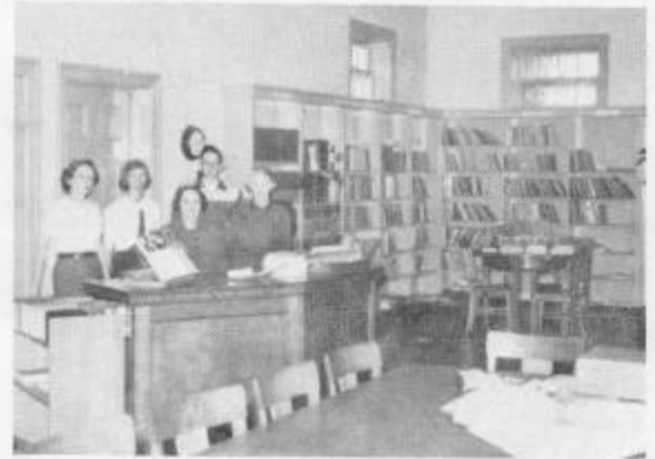
Staff of Regional Library